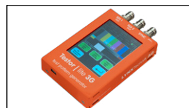
Testor | Lite 3G: PTG 1802 Portable test pattern generator for up to 3G SDI video transmissions. Includes options for test tone and custom overlays.